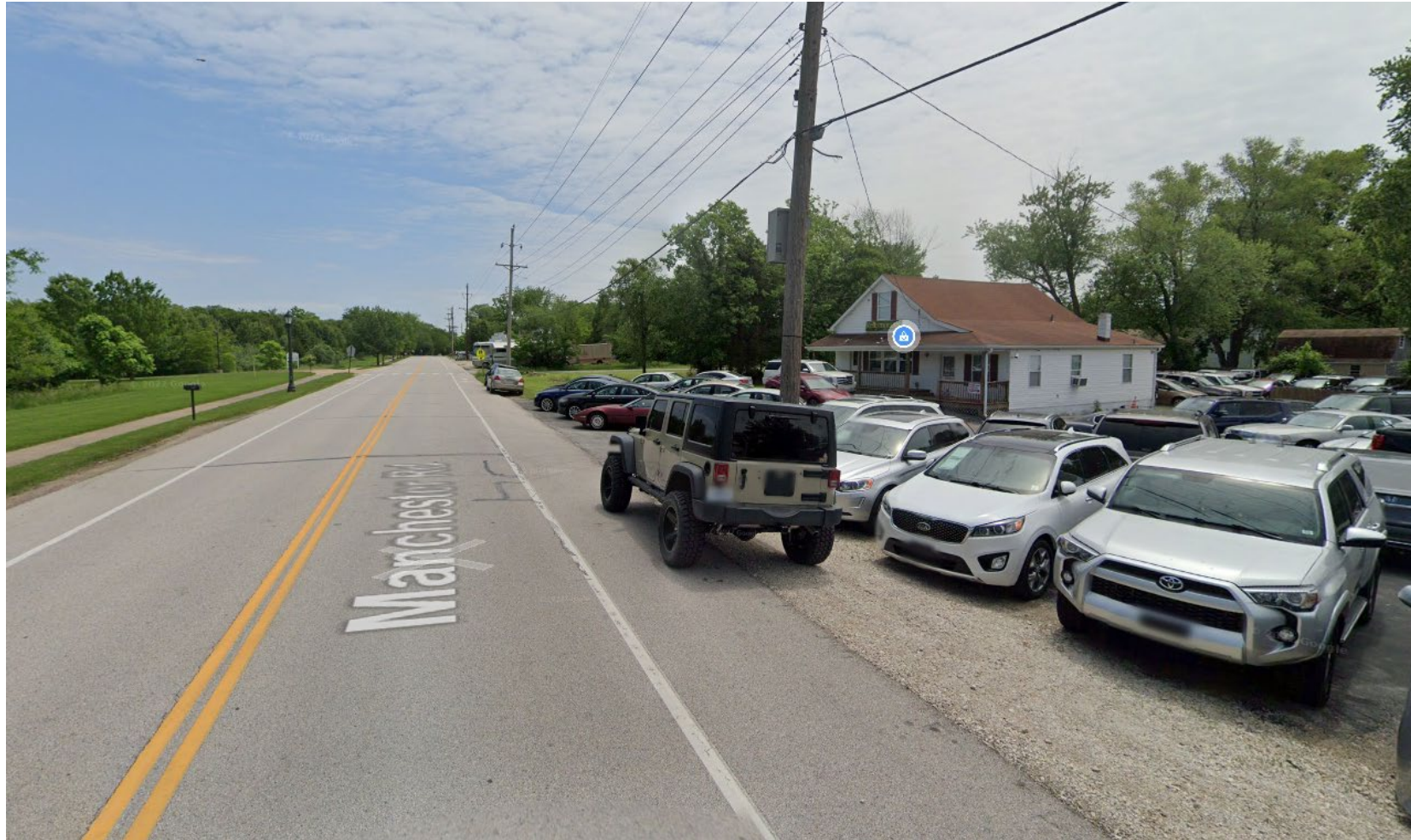
Exhibit A – Parking at 17330 Manchester Road (Facing East)