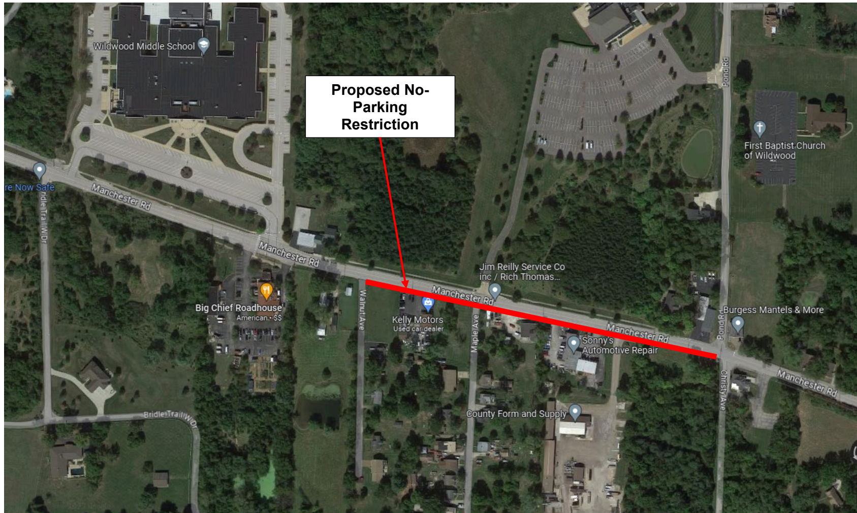
Exhibit B – Proposed No-Parking Restriction on Manchester Road between Walnut Ave and Maple Ave